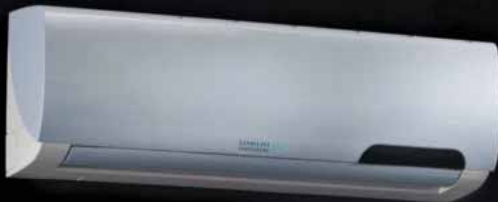
Air conditioning in style