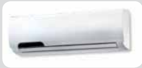
Version with pearl white casing