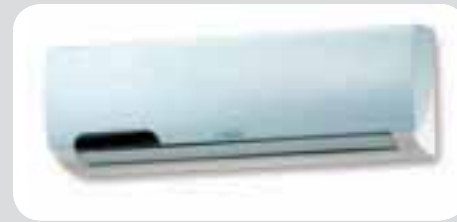
Version with light blue casing