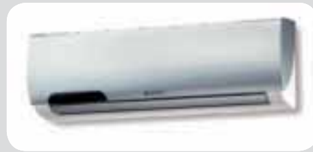
Version with silver casing